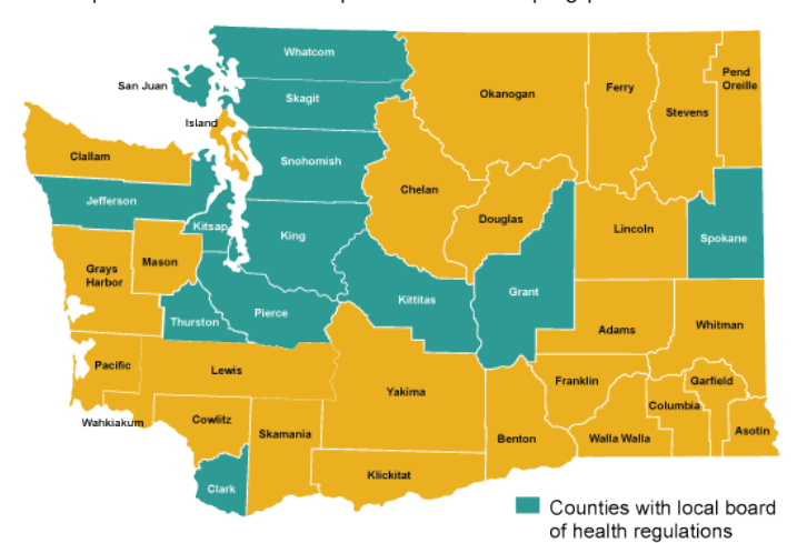
FIGURE 1: Local Health Board Regulations Timeline (Dates listed are effect dates.)

This map does not show municipalities with no vaping policies.