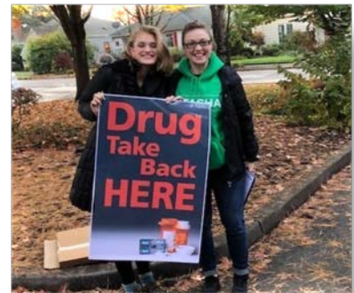
Prescription Drug Disposal Events in SW Region (Clark, Skamania, Klickitat) Annual events held in April and October

Prevent Coalition coordinated/supported/hosted multiple Drug Take Back initiatives in Clark, Skamania, Cowlitz and Klickitat counties. National Drug Take Back Day immediately changes the community by removing availability of unused medication, sharps and prescription drugs. In October 2018 there were 7 locations with 2,824 participants and 8,475 pounds collected. In April 2019 there were 8 sites with 1,623 participants and 4,311 pounds collected.