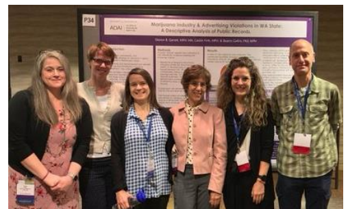
2019 North American Cannabis Summit